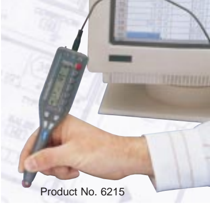
Product No. 6215

With the optional PC Interface Kit , you can instantly send values directly from your Scale Master II into your favorite PC spreadsheet or any estimating program. This compatibility feature will save you countless keystrokes and much time compared to manual input. Plus, you'll reduce data transfer errors and speed up estimate/bid completion and accuracy.