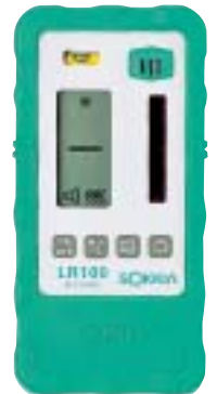
Fitted with Protector LRP1A