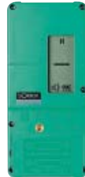
Display on reverse face