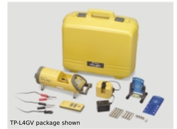
TP-L4GV package shown