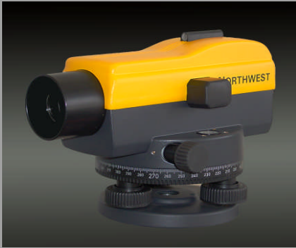
NBL Series Builders Automatic Level