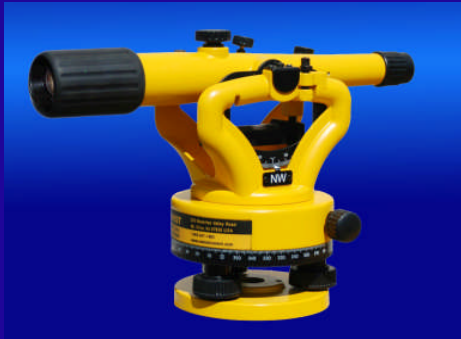
NSL500B Transit Level